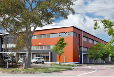
Star Building Hornsby Ku-Ring-Gai Hospital Redevelopment Stage 1

Client: Richard Crookes Construction Location: Hornsby Year Complete: 2016