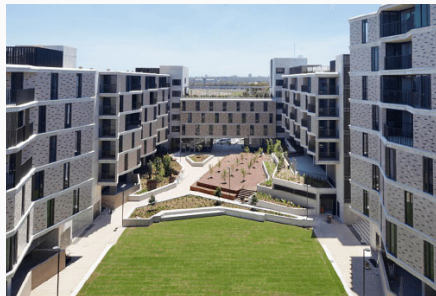
The Kensington Colleges

Client: Richard Crookes Construction Location: Redfern, NSW Year Complete: 2017