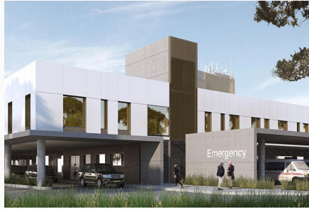
Sutherland Hospital Extension

Client: Richard Crookes Construction Location: Hornsby Year Complete: 2016