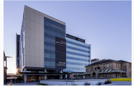
The Bright Alliance Building - Prince Of Wales Cancer Centre

Client: Richard Crookes Construction Location: Sutherland Hospital Year Complete: 2018